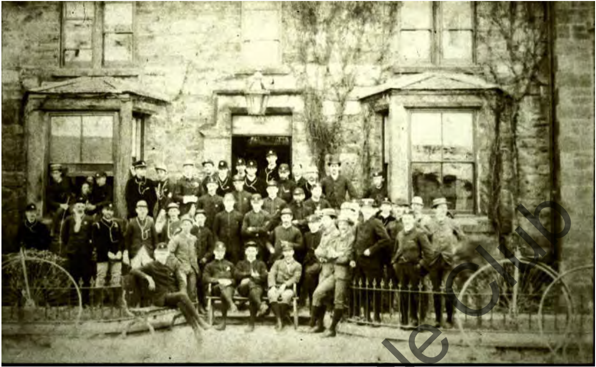
The Anfield Bicycle Club, Glan Aber Hotel, Betws-y-coed, circa 1885