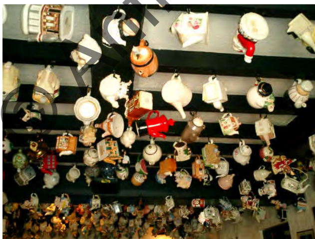
Teapot lounge, The Buck

With heavy showers around, we were lucky to avoid them all, riding from Chester in brilliant sunshine. South of Holt, the River Dee had flooded far and wide across the fields, and the lanes were very wet and muddy.